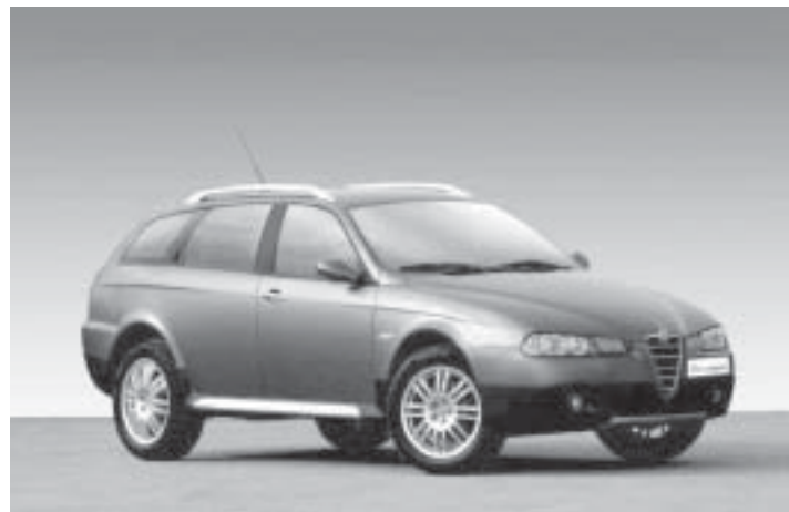
Alfa 2004 Crosswagon