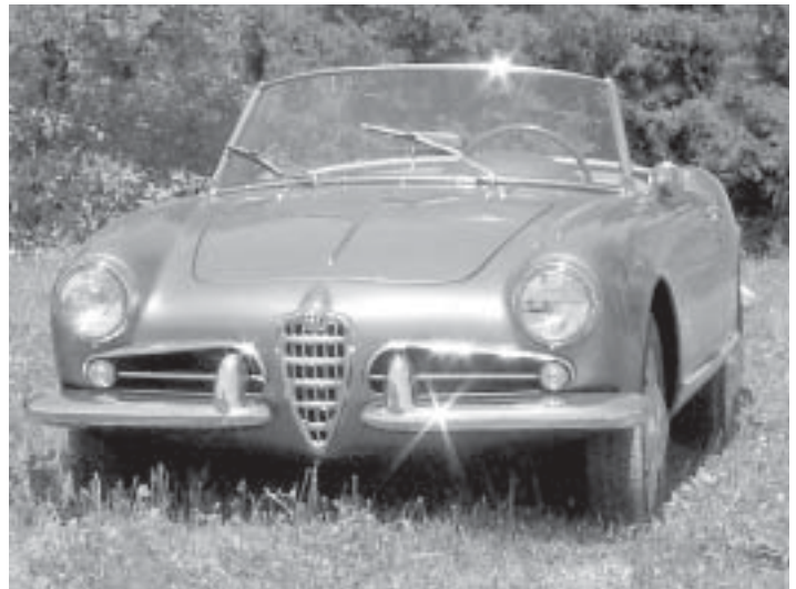
Ralph Coldewe's '59 Giulietta. The color version of this photo is the source for the group project.

There are a couple of sections still available -- if you want to participate give me a call (314 962 7833) or email (jhirsch@catenary.com).