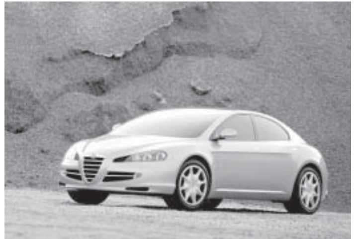
Italdesign 2004 Visconti