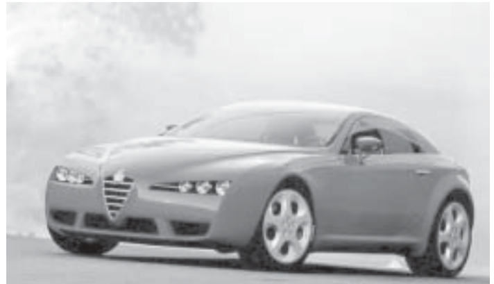
Italdesign 2002 Brera

Stola will show its S85 concept, a limousine version of the Thesis, Lancia's flagship. Only one Thesis limousine has been built. Fiat gave the car to Italian President Carlo Azeglio Ciampi in June 2002.