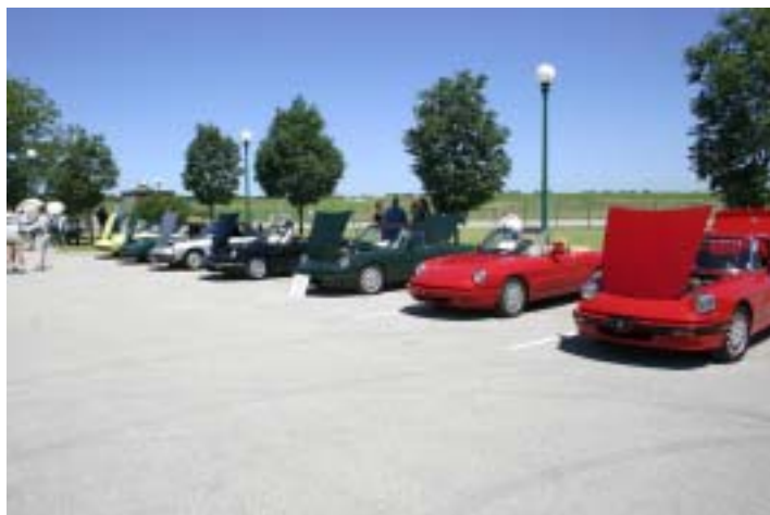
Spiders in Concours.