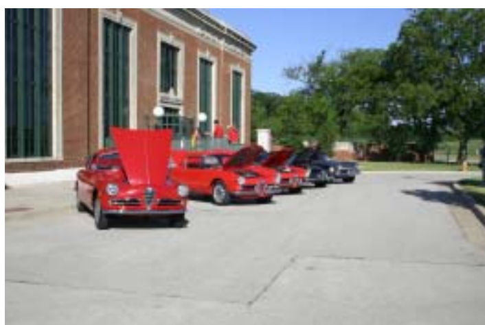
Giulia and Giulietta coupe and spiders.