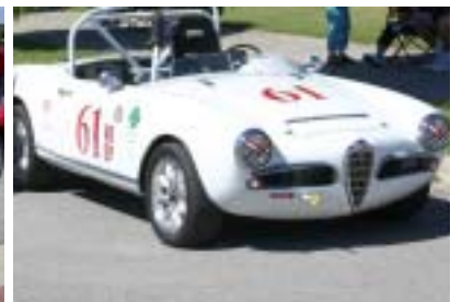
Giulietta race car.