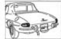
1600cc with carburetor and 1750cc with SPICA fuel injection