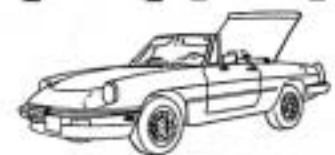
Bosch L-Jetronic; interior changes for 1986