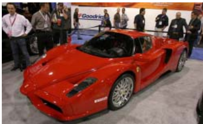
Ferrari Enzo, before. . .

Haikus needn't rhyme As long as it's from the heart But YOURS was Sh_tty!