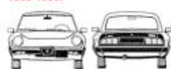
Series 3— Duck Tail Cars, 1983-1990: