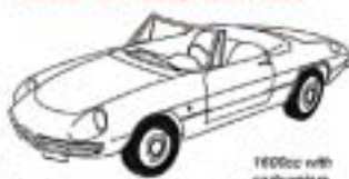
Series 1— Round Tail Cars, 1967-1969:

SERIES IV 1991-1994: If the Spider has wrap-around taillights, no trunk spoiler, and bodycolored wraparound bumper covers, it's the final Pininfarina redesign, manufactured from 1990 to 1993 and sold in the U.S. as a 1991 to 1994 model.