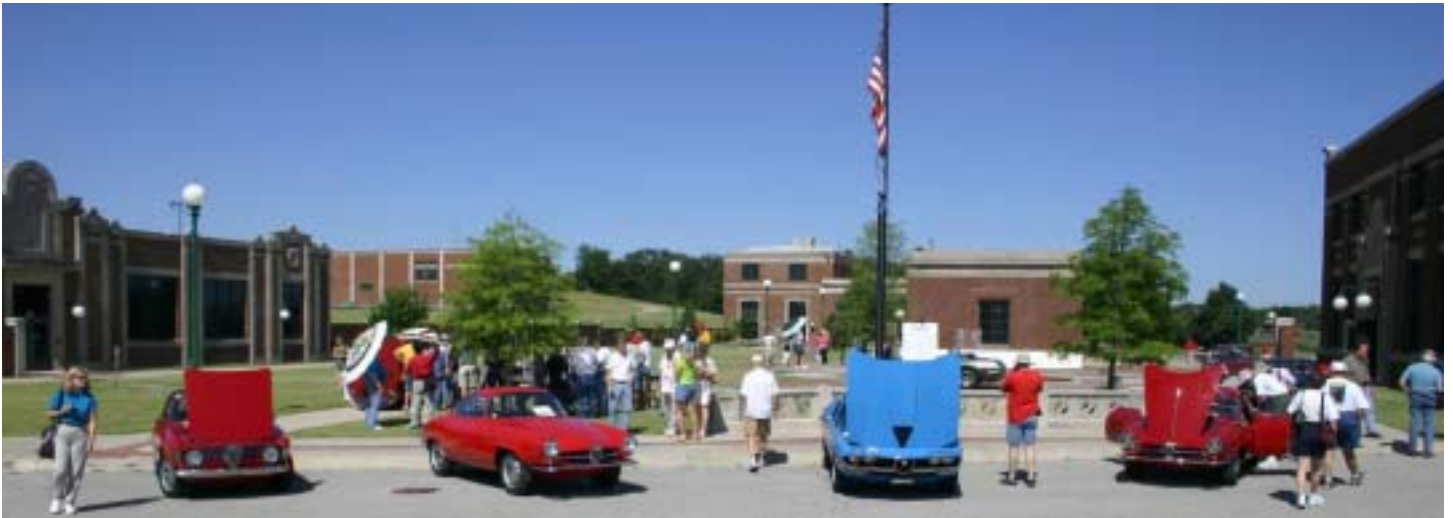
Concours at the Tulsa Waterworks -- special-bodied cars took center stage.