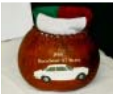
Painted gourd that beat Rich's Alfa logo stained glass.