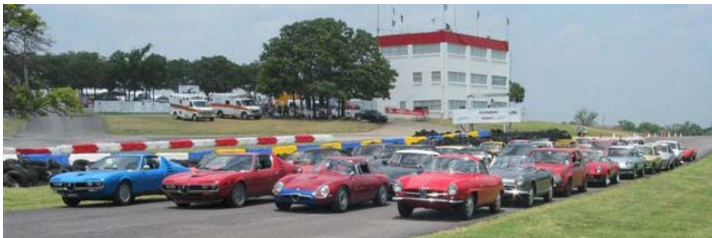
At the track .