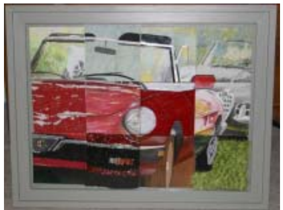
"Refleations" by St Louis AROC received a second place trophy.