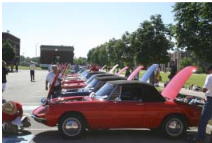
Lineup of Duetto-bodies, seven total.