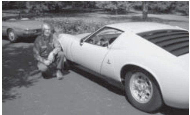
Lambo Muira SV ca. 1972. Duetto in background.