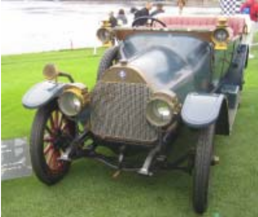
Sole surviving 1910 24hp ALFA (not yet Romeo) Torpedo last flew from Italy to Pebble Beach in 1985 and wound up towing a Tipo 159 Alfetta back to its transporter when it ran out of fuel.