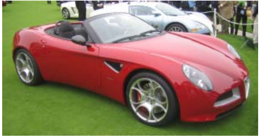
The first time ever seen in public, the open-top variant of the 8C Competizione, claimed its share of ooos and ahhs as part of the concept car circle. They didn't exactly let us flip up the hood; but, allegedly, the same 4.2L V8 of the coupe version lurks under there. Will she or won't she be produced? For us? Ah...

There's something really wrong about a jumbo-tron at the Concours d'Elegance. But I guess if you haven't been there when the 18th green was a hug at first sight, a bow and flourish attempt to prep you for the initial jaw-dropping glimpse of wave after wave of gorgeous machinery coming at you from the fairway, then maybe it wouldn't seem so, well, unbecoming.