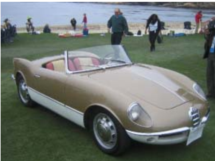
One of my-pick coolest, the 1955 Giulietta Prototype Bertone Spider, a heavy metal sales package / want-your-business demo that never, of course, went into production.