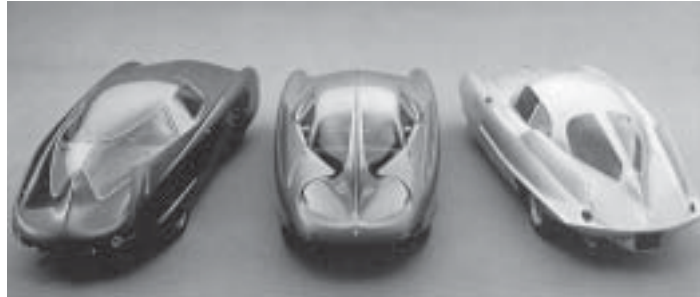
BAT cars 5, 7, and 9 (1953-1955)

The BAT 11 will continue the line more than 50 years after the BAT 9 was created by a little styling shop in Turin and ended up being driven by a young boy on the dusty roads of northern Michigan.