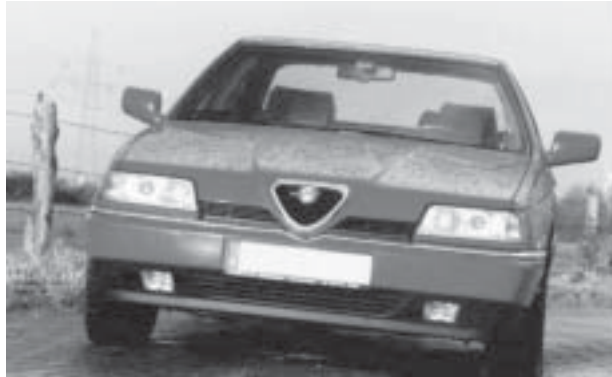
"Quiry" Alfa Romeo 164