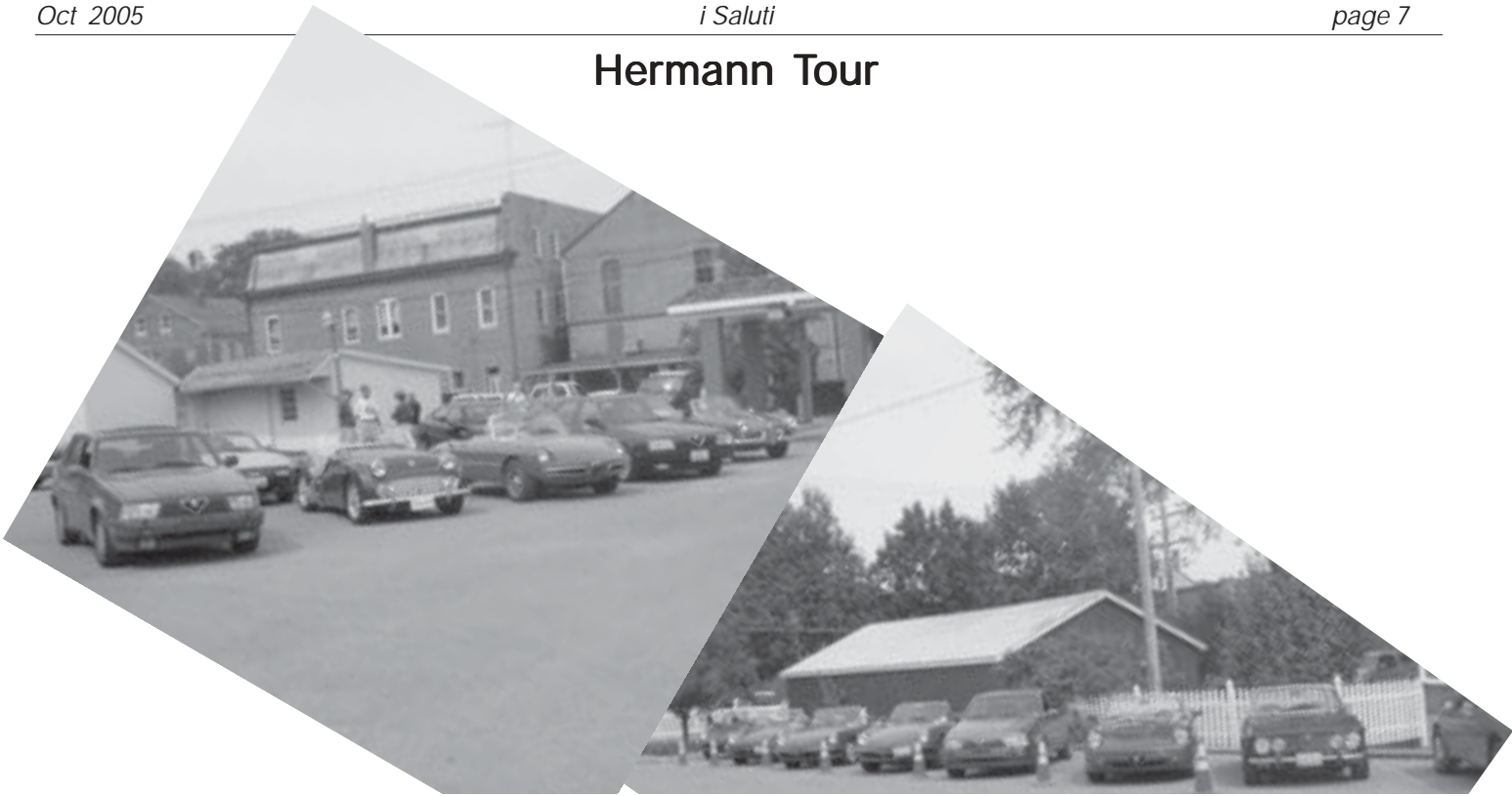
Alfas and a Triumph TR3 park in the parking lot outside the restaurant in Hermann.