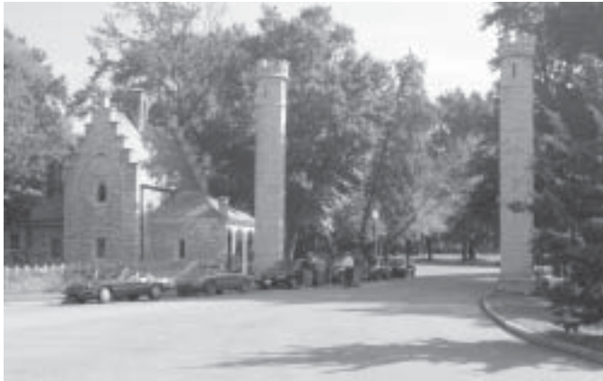
Alfas assembled at the entrance to Tower Grove Park.