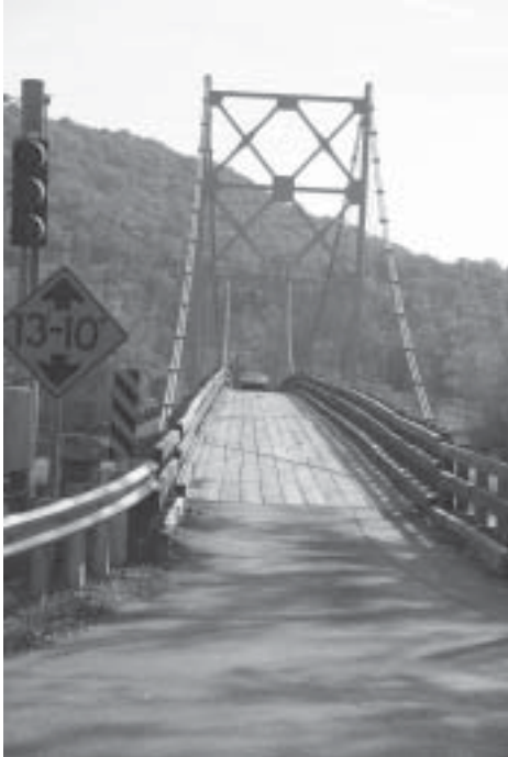
During the rally the Montreal crosses the one-lane bridge over the White River.