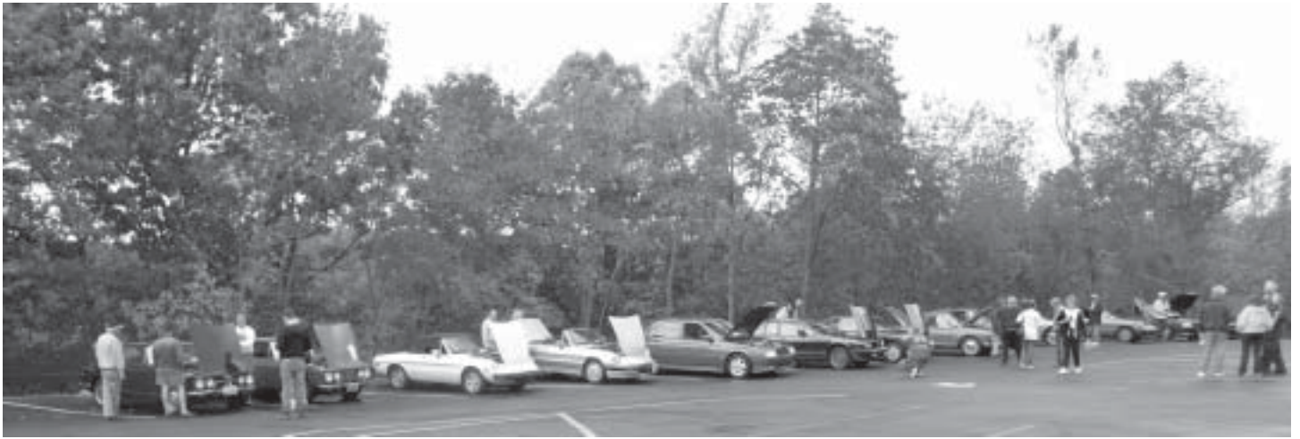
A huge turnout this year -- for a great weekend.