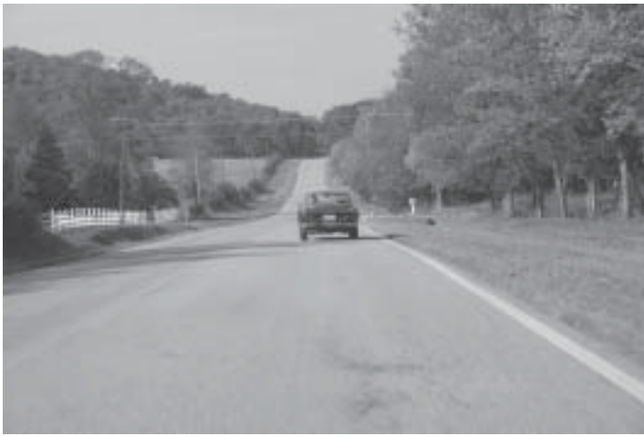
On the road again: Mike Houser driving the '69 GTV.